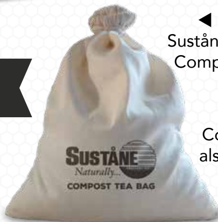
◀ A reusable Sustāne 5 lb. 4-6-4 Compost Tea Bag

21 gram 4-6-4 Compost Tea Bags can also be used as Root Zone Feeder Packs ▼