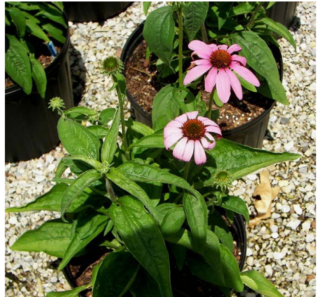
'Magnus' Echinacea, Columbus, Ohio summer 2008.

Tyler, et al. (1993) 1 reported the addition of aerobically composted turkey litter to container substrate for production of ornamental crops is beneficial to plant performance, improved container substrate nutrient retention and provided adequate nutrients for plant growth, including micronutrients. The trial herein is predicated on the work of Tyler et al. (1993) and was designed to evaluate the effect of Sustane® 16-4-8 (120 day) control release fertilizer on plant performance of 'Magnus' echinacea. More than half of Sustane 16-4-8 is composed of an all natural fertilizer derived from aerobically composted turkey litter. The trial compared Sustane 16-4-8 (120 day) to an industry standard 18-6-12 (8-9 mo.) control release fertilizer. Each fertilizer was incorporated at a rate of 1.8 pounds of nitrogen per cubic yard. The potting medium was 100% pine bark.