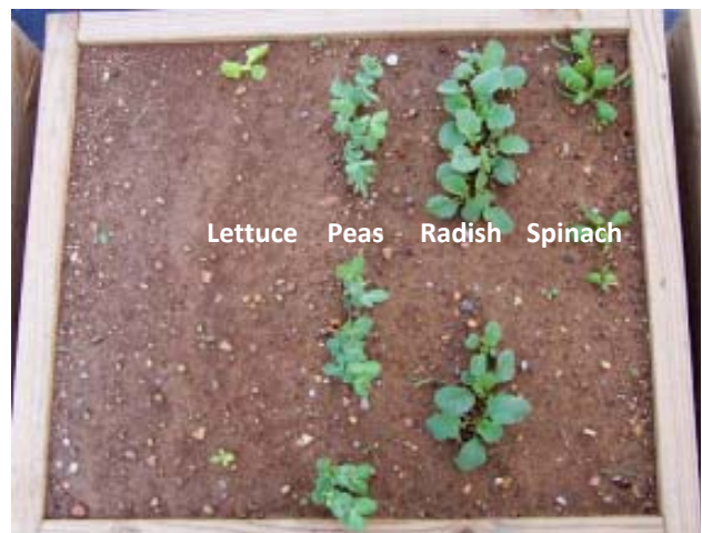
Scotts Miracle Grow 7-1-2 "Organic Choice" Applied at 3.75 lb. N per 1,000 sq. ft.