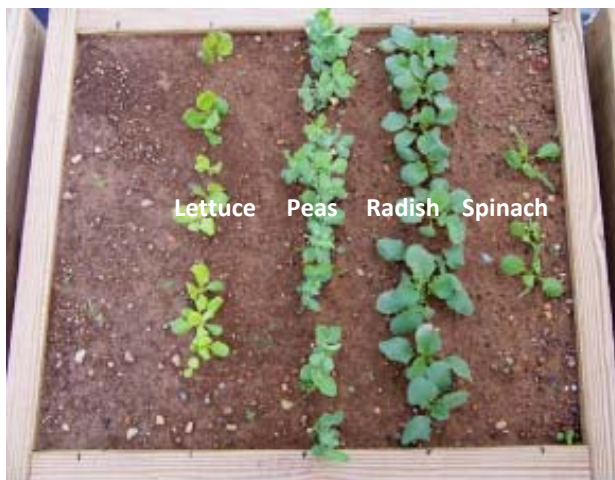
Experimental Vegetable Seed Starter Mix Formulated with Sustâne 3.75 lb. N per 1,000 sq.

All treatments supplied 3.75 lb. N per 1,000 sq. ft. (or 1.19 kg. per 100 sq. meters.)