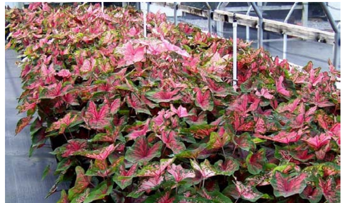
Picture taken 85 days after planting Rydal, GA during the summer of 2008

Due to increased environmental awareness and escalating costs of quality control release fertilizers greenhouse production is in need of alternative nutrient sources, preferably derived from sustainable resources. Therefore, Sustane® 12-12-12 (90 day), a natural based fertilizer made from aerobically composted turkey litter blend with high quality coated controlled release fertilizer was evaluated for use on 'Fire Chief' Caladium. The trial compared Sustane 12-12-12 (90 day) to two industry-leading controlled release fertilizers, a 13-13-13 (T70) and a 14-14-14 (3-4 mo.). Each fertilizer was incorporated at a rate of 0.85 pounds of nitrogen per cubic yard. The potting medium was a 50:40:10 mix (by volume) of pine bark, peat and perlite.