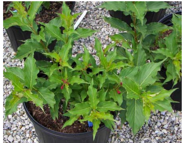
'Red Prince' weigela, Columbus, Ohio summer 2008.

Tyler, et al. (1993) 1 reported the addition of aerobically composted turkey litter to container substrate for production of ornamental crops is beneficial to plant performance, improved container substrate nutrient retention and provided adequate nutrients for plant growth, including micronutrients. The trial herein is predicated on the work of Tyler et al. (1993) and was designed to evaluate the effect of Sustane® 16-4-8 (180 day) control release fertilizer on plant performance of 'Red Prince' weigela. More than half of Sustane 16-4-8 is composed of an all natural fertilizer derived from aerobically composted turkey litter. The trial compared Sustane 16-4-8 (180 day) to an industry standard 18-6-12 (8-9 mo.) control release fertilizer. Each fertilizer was incorporated at a rate of 1.8 pounds of nitrogen per cubic yard. The potting medium was 100% pine bark.