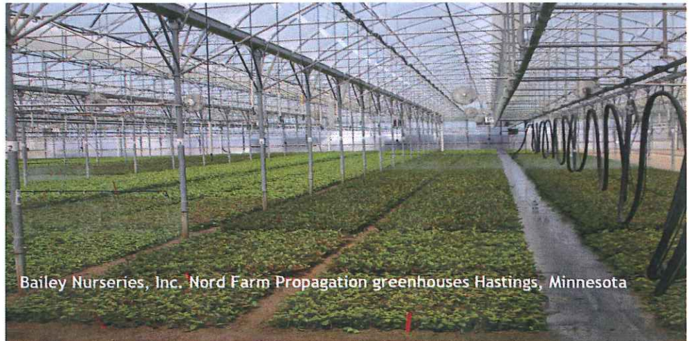
Bailey Nurseries, Inc. Nord Farm Propagation greenhouses Hastings, Minnesota

Bailey Nurseries, Inc. , one of the largest bare root growers in the world, established an experiment in 2008 at its Nord Farm greenhouses in Minnesota to evaluate Sustane organic fertilizer treatments for use in bare root production. As Sustane provided plant growth and quality comparable to conventional liquid feed but at significantly lower cost, Sustane 8-4-4 use has been expanded to treat over 180,000 sq. ft. of commercial growing area in 2010.