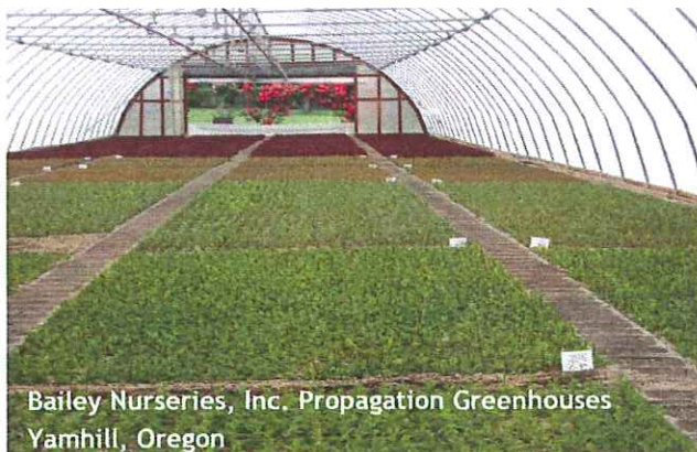
Bailey Nurseries, Inc. Propagation Greenhouses Yamhill, Oregon