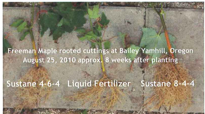
Freeman Maple rooted cuttings at Bailey Yamhill, Oregon August 25, 2010 approx. 8 weeks after planting

Sustane 4-6-4 Liquid Fertilizer Sustane 8-4-4